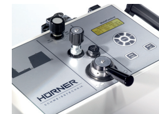
Front panel with GT keypad