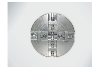
Welding neck support